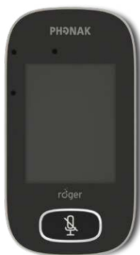
Roger Touchscreen Mic