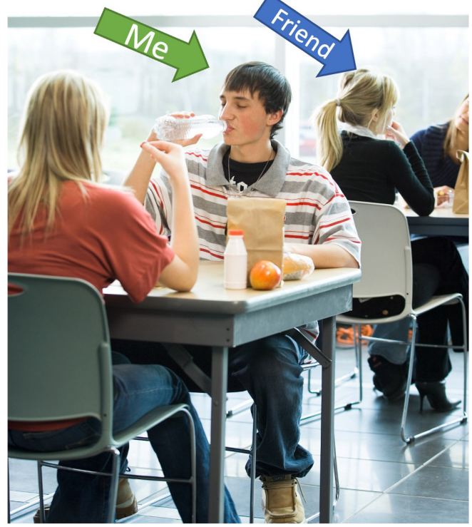
○ Very EASY

I am in a lunchroom. I am trying to understand a person talking at a table behind me.