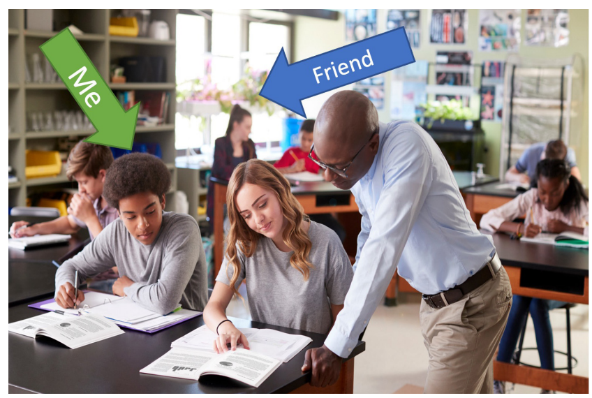
○ Very EASY

I am listening to the teacher in class and classmates start talking quietly behind me. I want to know what they are saying.