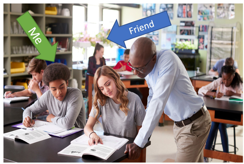
○ Very EASY

I am listening to the teacher in class and classmates start talking quietly behind me. I want to know what they are saying.