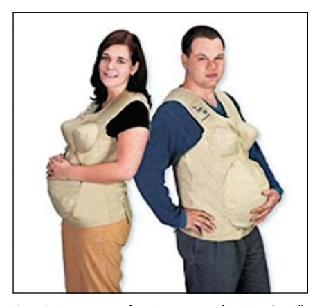
Figure 2. Screen capture from Amazon.com of an Empathy Belly Pregnancy Simulator (from Birthways) which is designed to help partners understand the experience of pregnancy.

A tool to further this discussion is the Hearing Handicap Inventory (HHI),3,4 a measure of the social and emotional consequences of hearing loss, and the proxy version, the HHI-SP.5 Whereas the HHI asks the person with hearing loss "Does your hearing problem cause you to feel embarrassed when meeting new people?" the HHI-SP asks "Does your hearing problem cause your significant other to feel embarrassed when meeting new people?" In a number of studies, the HHI and the HHI-SP have been administered to